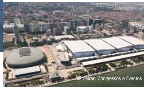
AIP Feiras, Congressos e Eventos