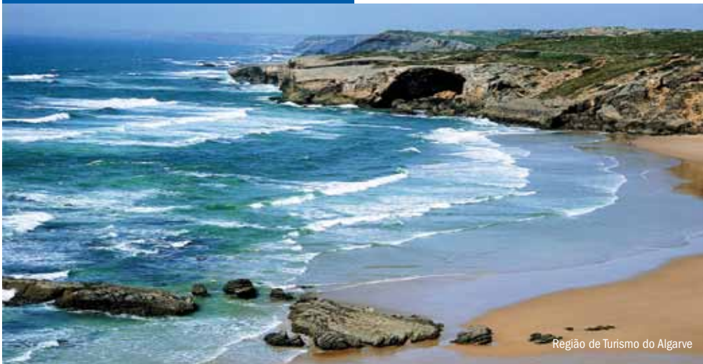
Região de Turismo do Algarve

The international airport in Lisbon offers connections to all of Europe's major cities as well as Portugal's paradise islands in the Atlantic. It's only a two-hour flight from Lisbon to the Azores or to Madeira island, often called the "floating flowerpot" for its variety of lush vegetation.